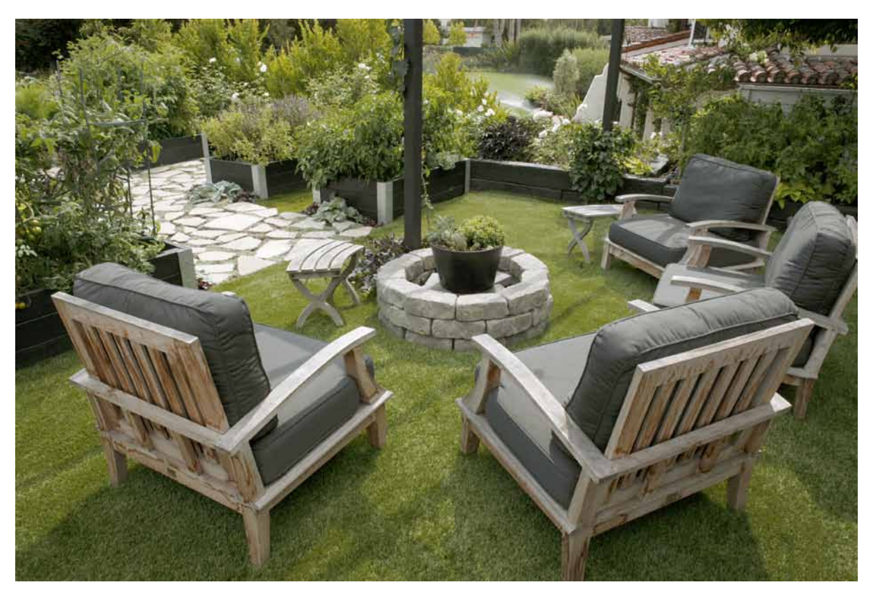
Comfortable chairs grouped in the dappled shade of the front yard allow adults to socialize while children play.