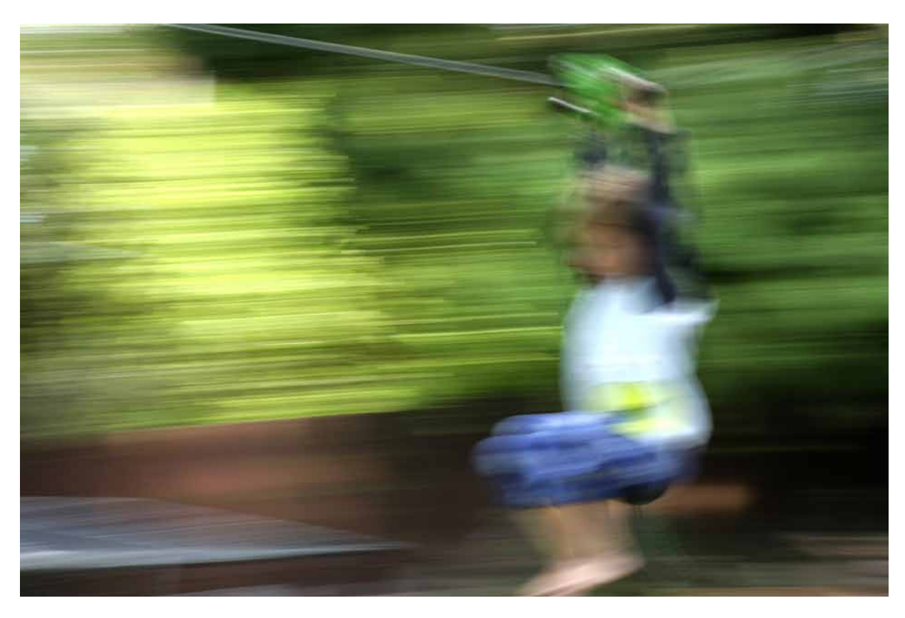
Engaged in the outdoors, the children are learning the values of their parents—and having a good time.