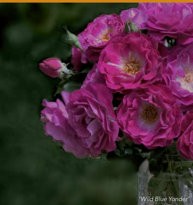
'Wild Blue Yonder'

2007 - 'Strike It Rich' 2009 - 'Cinco de Mayo' 2011 - 'Dick Clark'