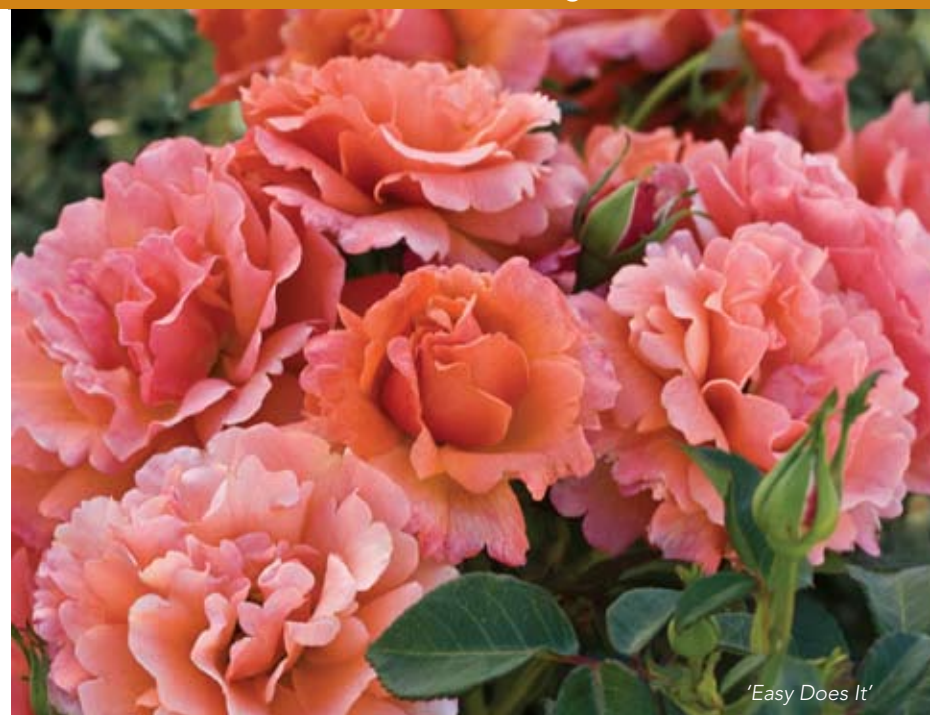
'Easy Does It'