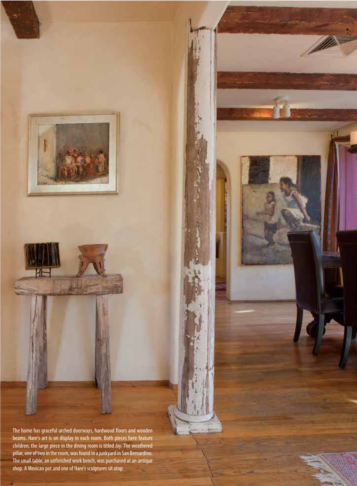
The home has graceful arched doorways, hardwood floors and wooden beams. Hare's art is on display in each room. Both pieces here feature children; the large piece in the dining room is titled Joy . The weathered pillar, one of two in the room, was found in a junkyard in San Bernardino. The small table, an unfinished work bench, was purchased at an antique shop. A Mexican pot and one of Hare's sculptures sit atop.